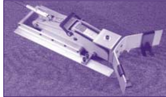
Hydraulic lift with adjustable custom clips for different panel manufacturers.

Without a doubt, it is simpler, faster and more cost effective to install new flooring under office systems using a professional lift system than to do the same job by dismantling and reassembling furniture, using jerry rigged tools not designed for the job and employing extra labor. And yet, a surprising number of facility managers either don't know about, or don't take advantage of flooring companies that use today's professional lift systems.