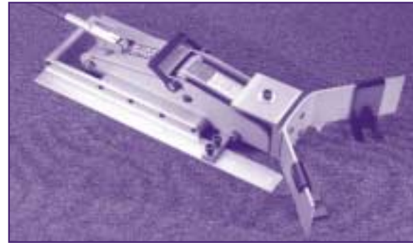
Hydraulic lift with adjustable custom clips for different panel manufacturers.

Without a doubt, it is simpler, faster and more cost effective to install new flooring under office systems using a professional lift system than to do the same job by dismantling and reassembling furniture, using jerry rigged tools not designed for the job and employing extra labor. And yet, a surprising number of facility managers either don't know about, or don't take advantage of flooring companies that use today's professional lift systems.