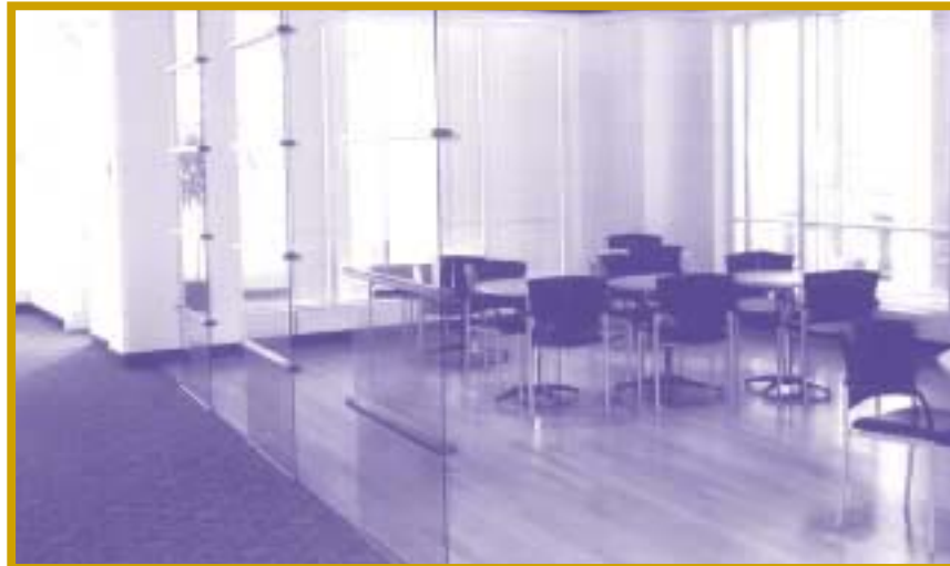
Combining wood or laminate with other floor finishes creates separation in interiors that offer an appealing mix of textures, colors and patterns.

Specifiers and facility managers can specify wood and wood look flooring with confidence. These next-generation natural and manufactured products fuse beauty with technology for floors that satisfy all criteria— aesthetics, performance, easy installation and easy maintenance. When used in full field installations, wood and laminate floors bring warmth and elegance to commercial interiors. When used in combination with other hard and soft