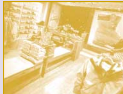
Beautiful, durable bamboo flooring is an environmentally responsible choice for commercial interiors.

Bamboo installation uses the same techniques as any hardwood, including glue-down and nail-down methods. Bamboo is slightly harder and denser than other woods, so a carbide blade is necessary to cut the planks. Your StarNet member is equipped to install bamboo floors including the newly introduced floating floor from TimberGrass including the glue and glueless profiles. The term "floating" applies to floor coverings in which the pieces are adhered to each other instead of being anchored to the substrate. The resulting floor literally floats above the subfloor, eliminating installation issues including telegraphing and moisture emission.