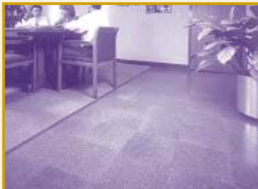
Cork's traditional warm honey tones and newer, lighter custom tints create design flexibility.

Cork tile has an indigenous brown hue derived from the bark itself. Plus, the longer it bakes—like a cookie—the darker the color. New stains and coatings are adding a wider spectrum of colors to cork flooring, including lighter, brighter shades and trendier colors for retail interiors. The granules in the tile determine the visual, which can range from highly burlled graining to non-directional looks. Cork tile is installed by the glue-down method. The floorcovering should be installed on or above grade level due to moisture issues.