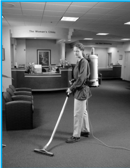
The cleaner the carpet, the cleaner the air and the healthier the indoor environment.

and backing. The cleaner the carpet, the cleaner the air, the healthier the indoor environment. Carpet cleaning equipment needs to be in good working order and used by trained personnel to ensure that dirt taken out of carpet is not released into the building interior or HVAC system. The best advice is to work with professionals who have invested in quality maintenance equipment, and whose employees are well trained in maintenance methods and materials.