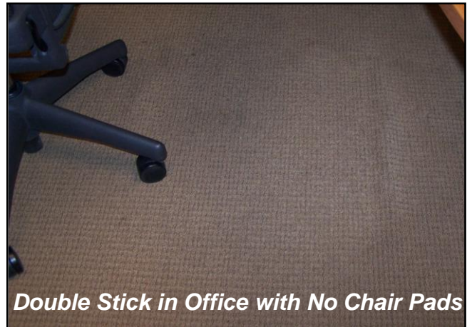
Double Stick in Office with No Chair Pads

Merchantability for service and fitness for intended purpose of use is a promise, arising by operation of law, that something that is sold will be merchantable and fit for the purpose for which it is sold. An item is deemed merchantable if it is reasonably fit for the ordinary purposes for which such products are manufactured and sold. This is relative in this case to flooring material. The biggest problem in the flooring industry is the wrong product specified or sold for use in the wrong place. All flooring material will not perform satisfactorily in all applications for any number of reasons. Manufacturers and reps don't always know enough about the products and particularly their installation because they don't always know the specific use it is going to be subjected to. An example is a tufted textured loop carpet installed with the double stick method in an office complex that uses no chair pads. This is an installation method that had no business being used in this application and as a result it failed. The installation system in this case, specified by the architect/design firm and blessed by the manufacturer's rep, was not fit for the intended purpose of use. However, that being the case, this would not be a situation that would instigate a legal action as there was no intent to defraud anyone or a question of quality. This was just a case of persons thinking something was appropriate for use when it wasn't.