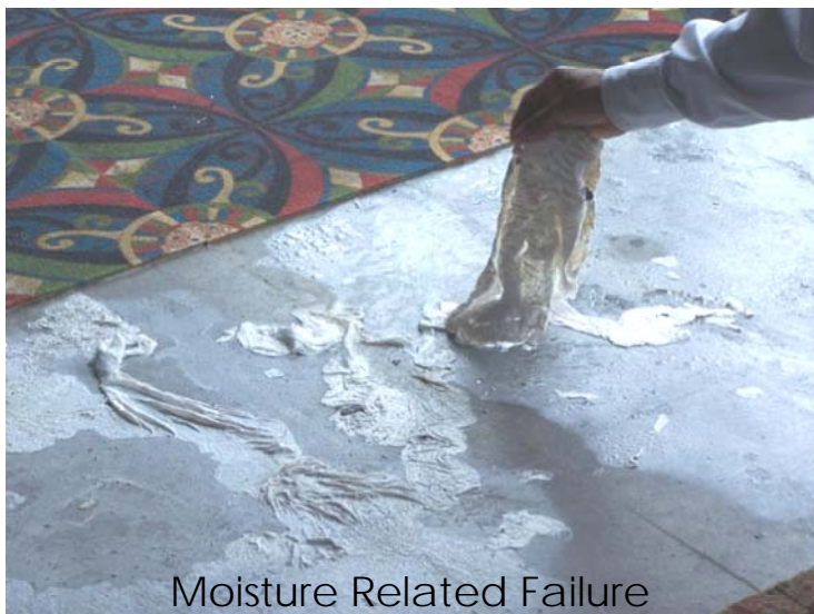
Moisture Related Failure

avoid liability for an installation failure when we know there are compromising circumstances that could put us in harms way? First of all there is not a blanket form absolving an installer or flooring contracting firm from liability for an installation failure. Each state has its own set of rules. It would behoove you to consult with an attorney in your market who practices construction law and have him give you guidance. It is important that you include any and all situations that you think may