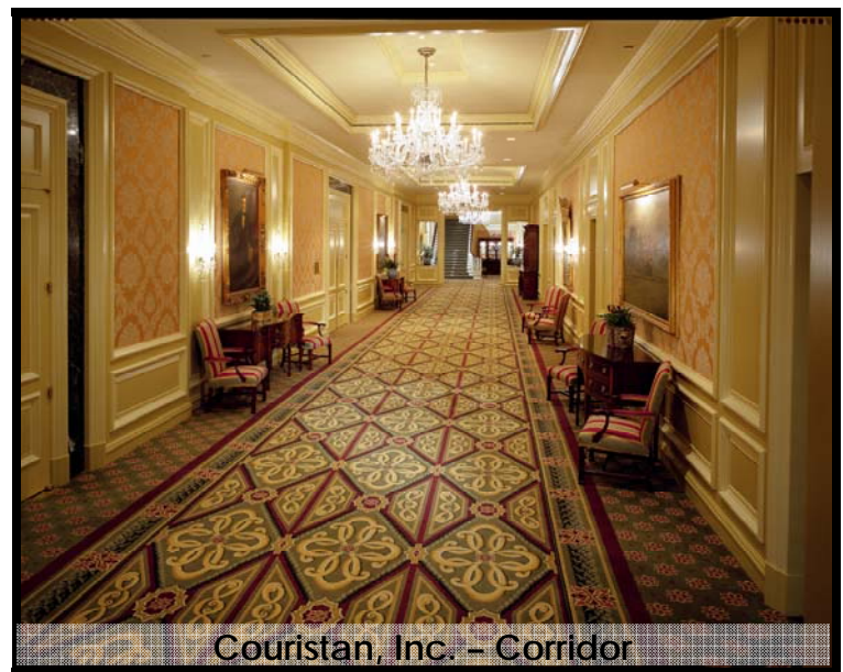
Couristan, Inc. – Corridor

characteristics and versatility of carpet tile, along with new innovative backing systems, many of them the result of recycling efforts, make carpet tile the hot property that it is. The fact that it is cannibalizing broadloom is not all bad for manufacturers as carpet tile is generally sold for more and can bring higher margins. One consideration is that all of the new innovations and recycling efforts, primarily having to do with the backings have created some challenges in the market place with the stability of the product. This is new territory for manufacturers and everyone wants to be in the game but be wary of the ramifications of having a problem with the product as it could be very costly. Fortunately, most manufacturers who a