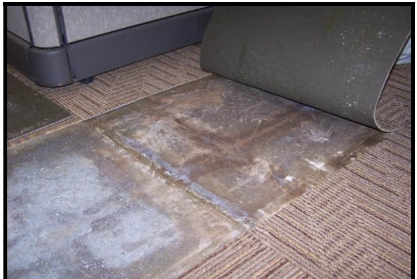
SLAB MOISTURE UNDER CARPET TILES

The biggest problems we're seeing in the field are still keeping the flooring material on the floor. The last two large claims we had come in at the end of 2007, one a health care facility and the other a commercial office space, were both caused by the carpet releasing from the substrate. One was a carpet tile that, aside from the fact the tile had its own set of defective issues, was installed on a slab that literally had water on it when the tiles were lifted.