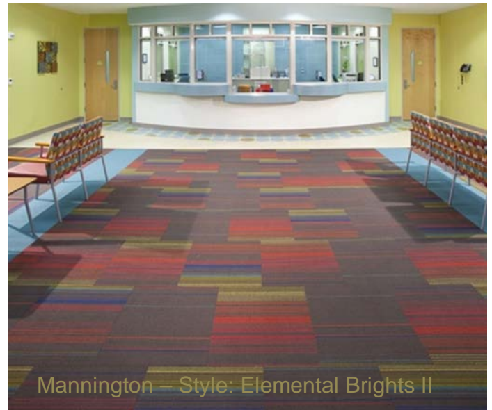
Mannington – Style: Elemental Brights II