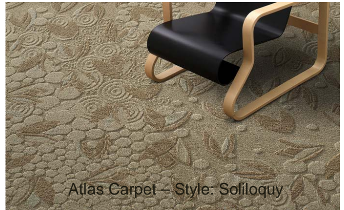
Atlas Carpet – Style: Soliloquy

Design: For all the marvelously beautiful flooring products on the market, particularly carpet, there remain a majority of fairly bland products. That's not to say everything has to be eye popping but a search of flooring manufacturer's websites reveals more dull than extraordinary. There are a couple of exceptions and the stand out is Atlas Carpet Mills, recently acquired by the Dixie Group. Not only does Atlas have the most highly styled, fashion oriented textile floor covering material but they have the best understanding of what style, fashion, color and texture mean and should be. You can almost walk into a facility that has an installation of Atlas carpet and tell it's theirs. And lest you think this is a paid endorsement of Atlas, they have no idea I'm writing about them. Just visit their website and then competitors and you'll see what I mean. And speaking of websites, which we will next, theirs has the best photos and clarity and ease of use. J & J has some good looking product as well, as does Mannington and a smattering of style from a few other manufacturers. It seems the bigger the manufacturer the less exciting the product is.