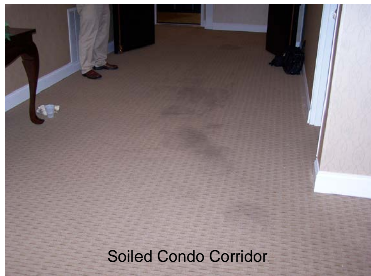
Soiled Condo Corridor

The multifamily market poses unique challenges to flooring materials. It can present disillusionment to those who don't fully understand what the performance levels are of the products being used and, if not properly specified or cared for, can cost far more than a low initial cost. Remember, the flooring material doesn't care what you think it should do, it only responds to what it is capable of doing. You can't put a square peg into a round hole.