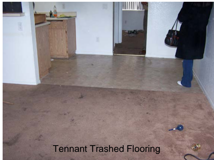
Tenant Trashed Flooring

One thing we've found over the years is regardless of the product, the care is less than stellar. Unfortunately price drives this market and the lowest priced cleaner, who basically blows in and out at several cents a square foot pricing, cannot do an adequate job of cleaning the carpet. This has lead owners and managers to think there's a problem with the product. We've proven this incorrect time and again. By taking products said to be impossible to clean or those felt to have a problem because they don't respond to the cleaning attempts being made, we've actually removed the carpet from whole units to subject them to proper cleaning and have achieved excellent results. The challenge lies with what has to be done to get the carpets clean and it requires efforts above the costs being expended by a complaining owner or manager. So, maintenance has to be adequate to the longevity and appearance of the carpets being used. Another factor is the tenants themselves creating problems in common spaces with carpet "ugly out." This is caused by trash being taken to the waste bins or dump chutes, dripping, spillage and contamination due to leaking plastic bags. Another killer culprit is bleach dripping which will damage the color of the carpet. All of these things will leave tell-tale signs that are irrefutably exhibited by the evidence. These conditions are often seen in the corridors of high rise condos and present unexpected problems.