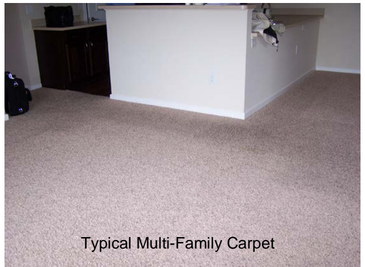
Typical Multi-Family Carpet