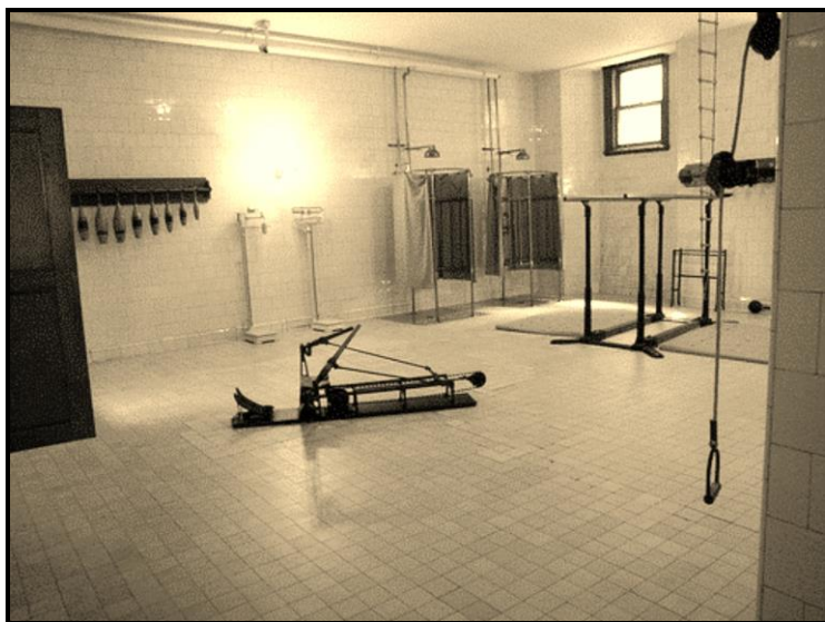
Gym at The Biltmore Estate Asheville, NC Opened in 1895.

Though there is not a guideline, The Carpet and Rug Institute has used a life expectancy of 7 to 12 years for carpet. This would be under ideal conditions and subject to a number of factors such as the right product in the right place, properly installed and maintained, in the appropriate color for the usage and the right style and construction for the application, plus the amount and type of traffic received, excepting influences outside the norm such as direct sunlight or UV exposure, chemical compromise from any treatment that may have been topically applied after market or during cleaning procedures, etc. Naturally, if flooring sees little or no use it will last until the building it's installed in falls down. If the flooring is a stone or ceramic type material it could last over 100 years.