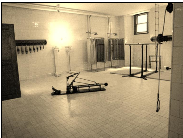
Gym at The Biltmore Estate Asheville, NC Opened in 1895.

Though there is not a guideline, The Carpet and Rug Institute has used a life expectancy of 7 to 12 years for carpet. This would be under ideal conditions and subject to a number of factors such as the right product in the right place, properly installed and maintained, in the appropriate color for the usage and the right style and construction for the application, plus the amount and type of traffic received, excepting influences outside the norm such as direct sunlight or UV exposure, chemical compromise from any treatment that may have been topically applied after market or during cleaning procedures, etc. Naturally, if flooring sees little or no use it will last until the building it's installed in falls down. If the flooring is a stone or ceramic type material it could last over 100 years.