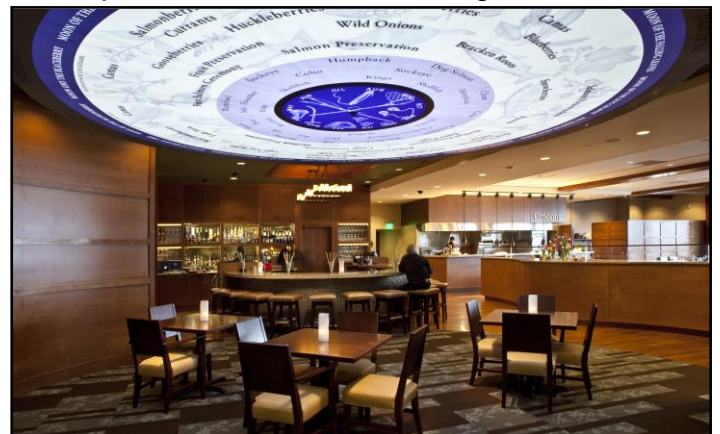
Rubenstein's Seattle, WA - Swinomish Lodge Hotel