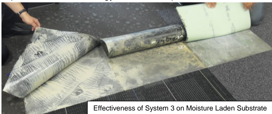
Effectiveness of System 3 on Moisture Laden Substrate

These flooring contractors practice their craft daily on the large stage of the commercial flooring market and avail themselves of the latest information for working with, installing and often maintaining every type of commercial flooring product on the market. They can also offer insight into what is the better product to use having knowledge of what materials may be problematic or not. When you have a large network of flooring contractors across the country they have the ability to query one another on problems that may occur and what to avoid and why. There are also a number of independent professional flooring contractors that can provide most or all of the services you need on a big project. Also consider that the groups mentioned have access to products they can offer you that are unique to a particular application that a flooring manufacturer may not have and the ability to work with the technology special systems require, such as technology we've developed for moisture sensitive substrates.