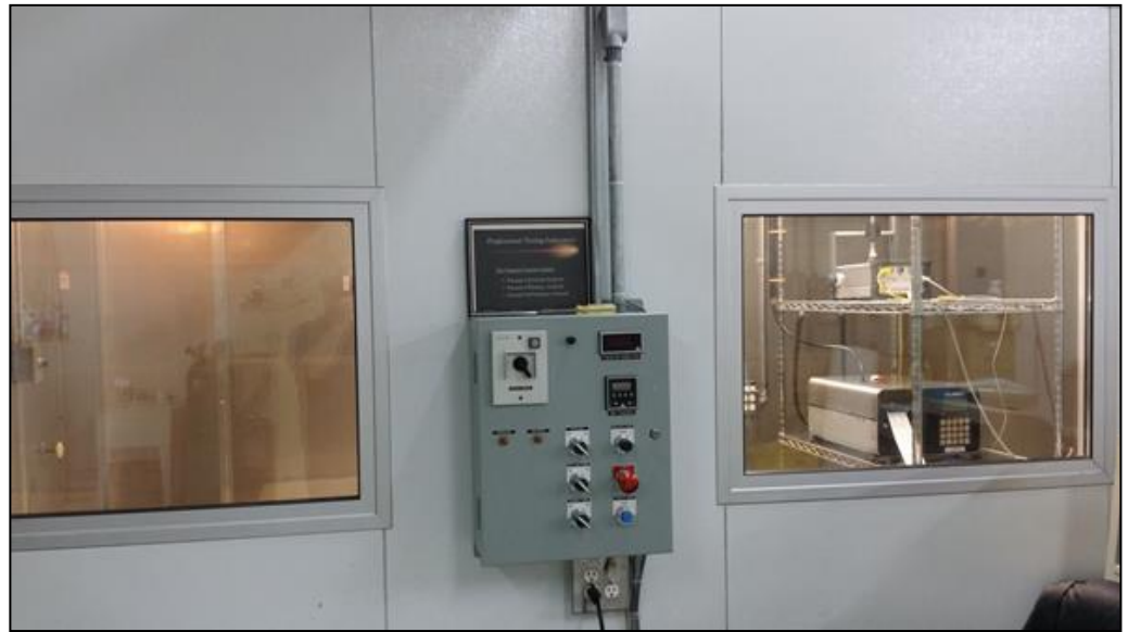
ASTM E1333 Standard Test method for Determining Formaldehyde Concentrations in Air and Emissions Rates from Wood Products using a Large Chamber

All the tests are based on the accurate measurement in parts per million of formaldehyde emitted from the material into the air. By knowing the volume of the material and the volume of air in the chamber calculations are made as to the quantity of contamination resulting from the presence of the test product. The values listed in the CARB II standard go from 0.13 ppm down to 0.05 ppm depending on what category the product falls into based on the CARB II tables. To put this in perspective I use a simple analogy of applying 1,000,000 golf tees which would fill a large size SUV. One tip end (0.1 inch long) of 1 single golf tee would be the representation of 0.13 ppm. If more than 0.13 ppm of formaldehyde is found in the air, the material as tested would be outside of compliance for the CARB II regulations.