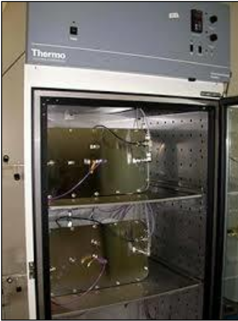
ASTM D6007 Standard Method for Determining Formaldehyde Concentrations in Air from Wood Products using a Small Chamber