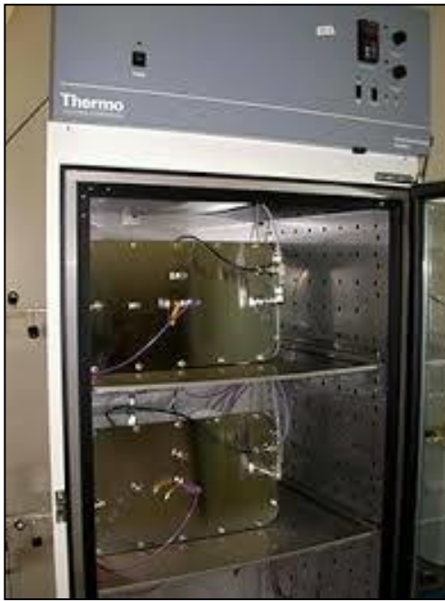
ASTM D6007 Standard Method for Determining Formaldehyde Concentrations in Air from Wood Products using a Small Chamber