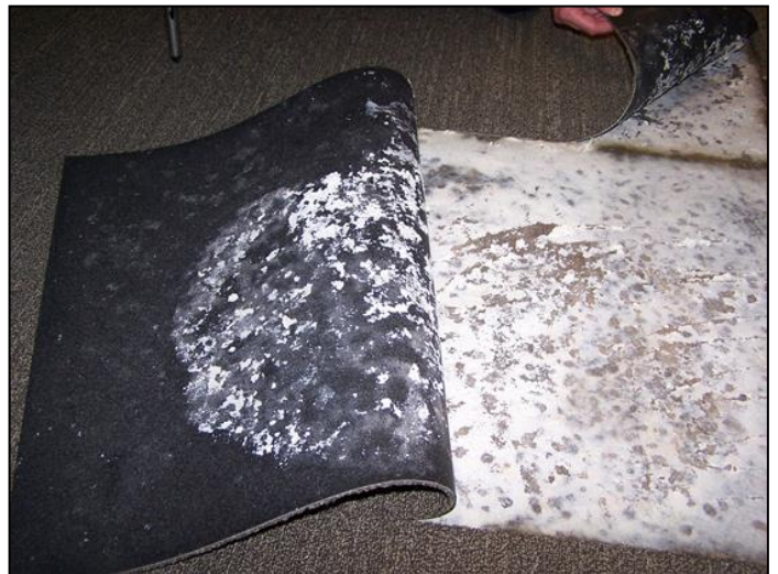
But it's not.