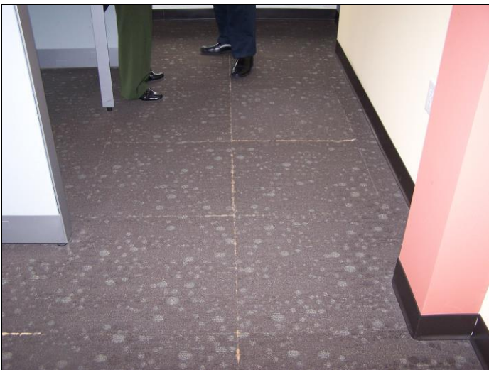
You may think it's the flooring...

Identifying what the problem is as specifically as possible is the first action that should be taken. Just what is the problem as best as can be identified? Normally the first thought is the flooring material itself is the problem because that's what can be seen – it's the flooring that's visibly manifesting the problem. This is understandable because most people really don't know what's wrong and that can include everyone from the manufacturer to the property owner and anyone in between who had anything to do with the project.