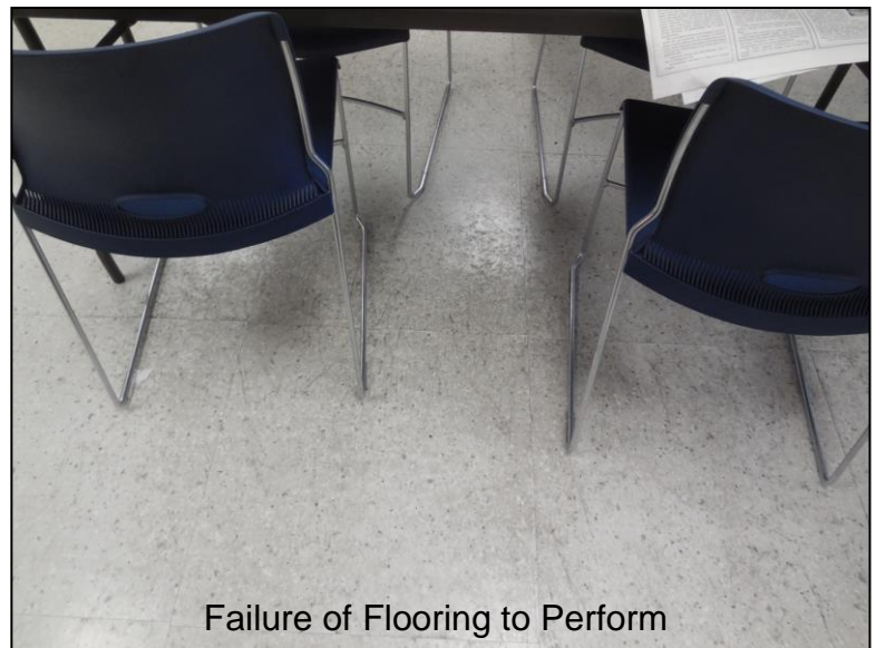
Failure of Flooring to Perform